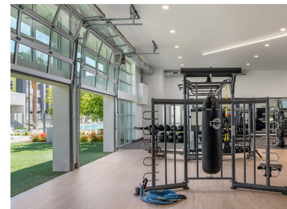
FITNESS CENTER AND OUTDOOR GRASS PRADO