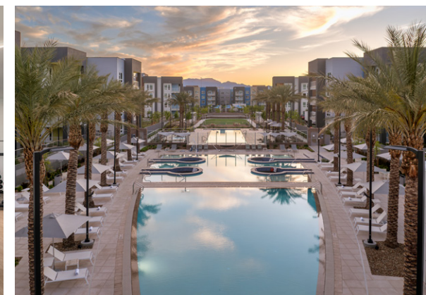
RESORT-STYLE POOL TERRACES